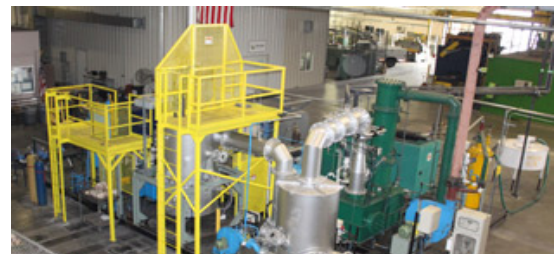
SACRAMENTO, CA / USA

In 2010, a PTDR-100 system was commissioned at a commercial R&D foundry. Locating and permitting a system in California - the most stringent air emission state - illustrates the minimal environmental footprint associated with the PTDR technology.